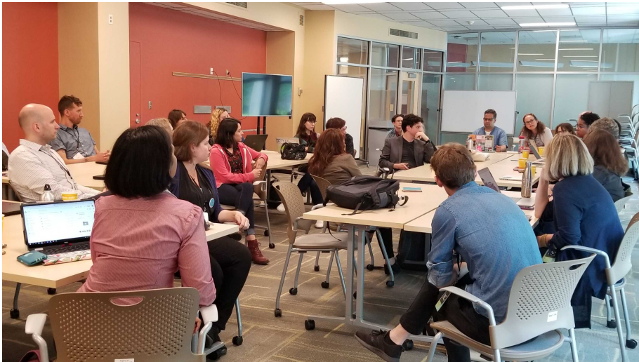
Immersive Pedagogy Symposium participants in discussion.

Carnegie Mellon University (CMU) Libraries hosts the symposium's materials on its institutional repository, KiltHub. KiltHub provides stable, long-term global open access storage for 3D/VR/AR assets, and functional applications, as well as pedagogical and technical documentation. Materials in this repository are held for a minimum of ten years, ensuring that what is submitted will remain available past typical terms of software updates. The teaching materials produced during and following the symposium will also be published in the Digital Library Federation's Pedagogy Working Groups open-access series, the DLF Teach Toolkit. The materials will be revised and tested, including during a pre-conference workshop at DLF's Annual Forum 2020.