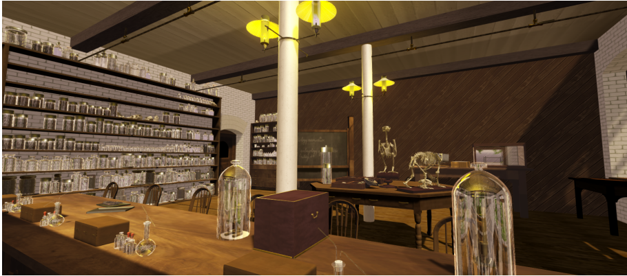
Screenshot of the 3D-rendered Advanced Biology Lab c. 1900, from Bryn Mawr Women in Science .